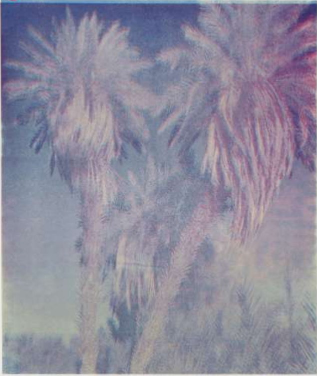
10/15 Wolfgang Plöger, Palm Trees of Iraq #17 (C/M/CM/K) , 2015