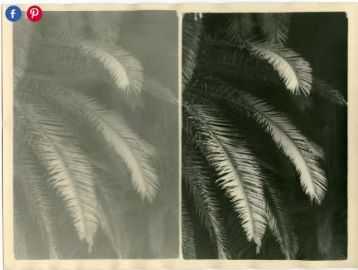
8/15 Sigmar Polke Palmen (Palm Trees) , 1968

©Bruno V. Roels , Courtesy Gallery FIFTY ONE