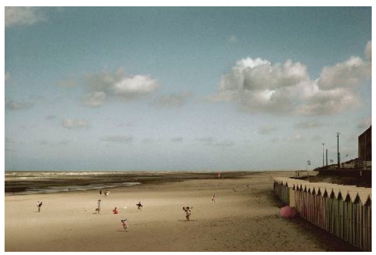
Fort-Mahon-Plage, Bay of Somme, France, in 1991.