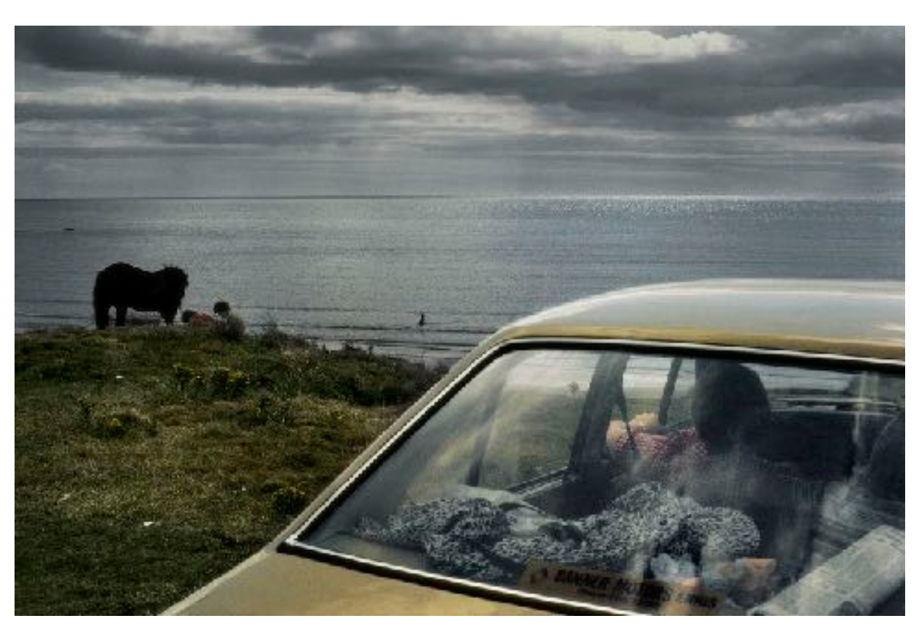
County Kerry, Ireland, in 1988.

"Harry Gruyaert ignores the grammar of center and edge, finds the blurred boundaries of overlapping life, the places where one thing has begun to be another thing. . . . He photographs, transmits worlds made numinous by the perfect confusion of edge and center, the perfect juxtaposition of culture and nature, the crossed voltages of immediate singular presence, the highly refined languages of art. . . . He photographs the boundaries that hover just beyond our sight too, the shadows of an actual reality too blurred, too confused, too nuanced for any language to hold. He captures it whole. He holds it. As powerful art. As heart wrenching beauty. As the overwhelming mystery of ungrammatical silence."