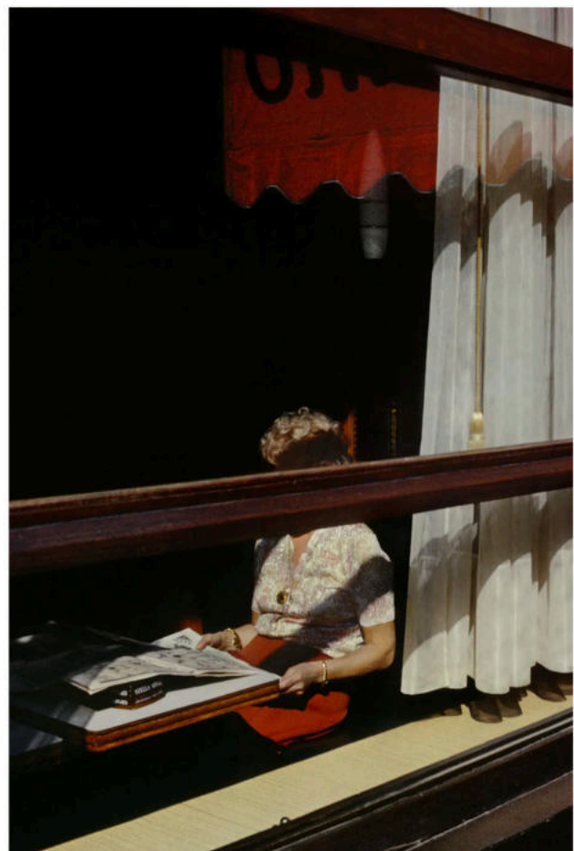
© Harry Gruyaert | Courtesy Gallery FIFTY ONE