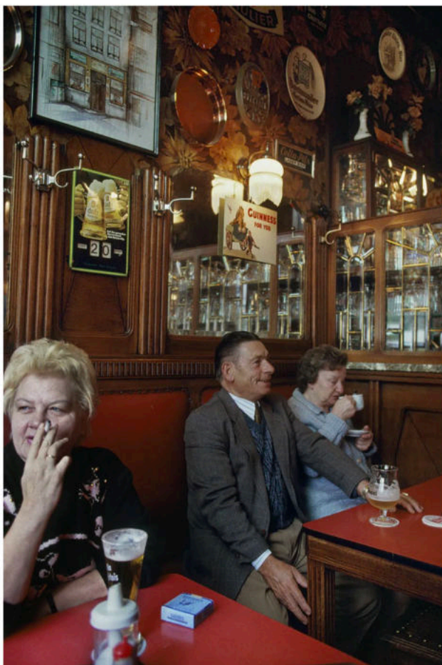
© Harry Gruyaert | Courtesy Gallery FIFTY ONE