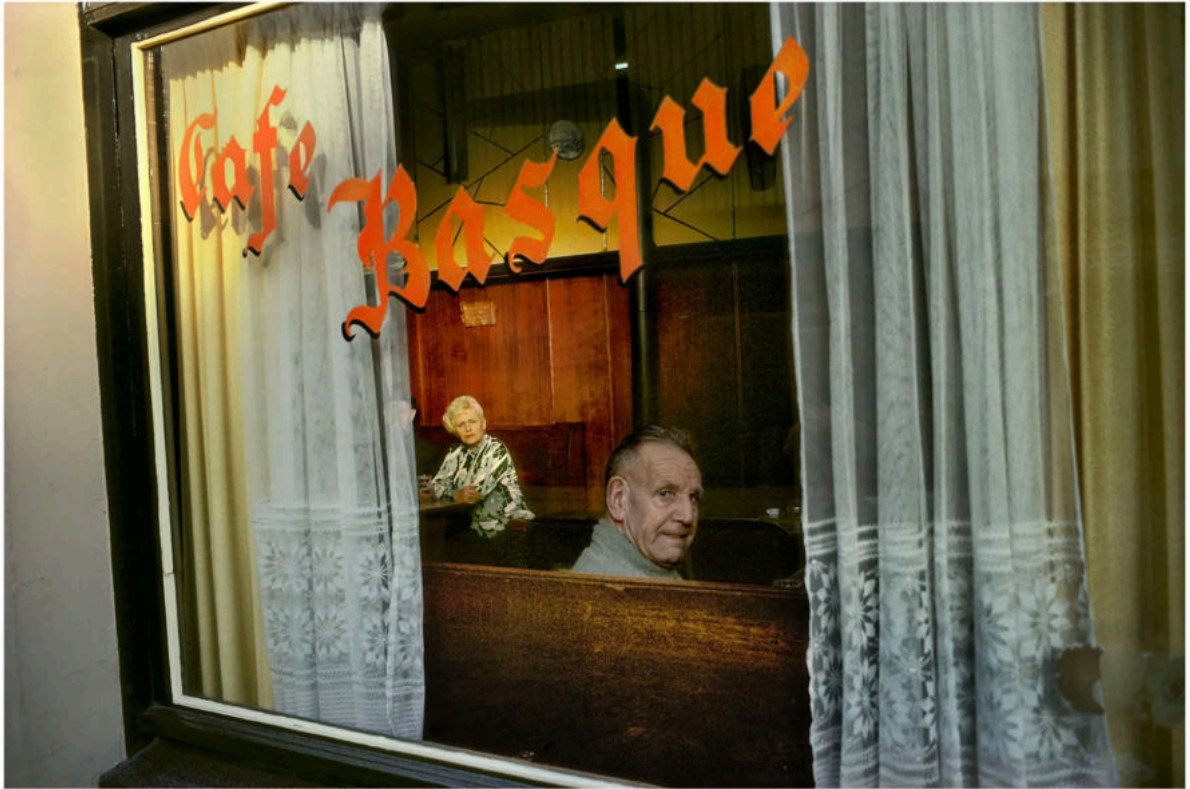
© Harry Gruyaert | Courtesy Gallery FIFTY ONE