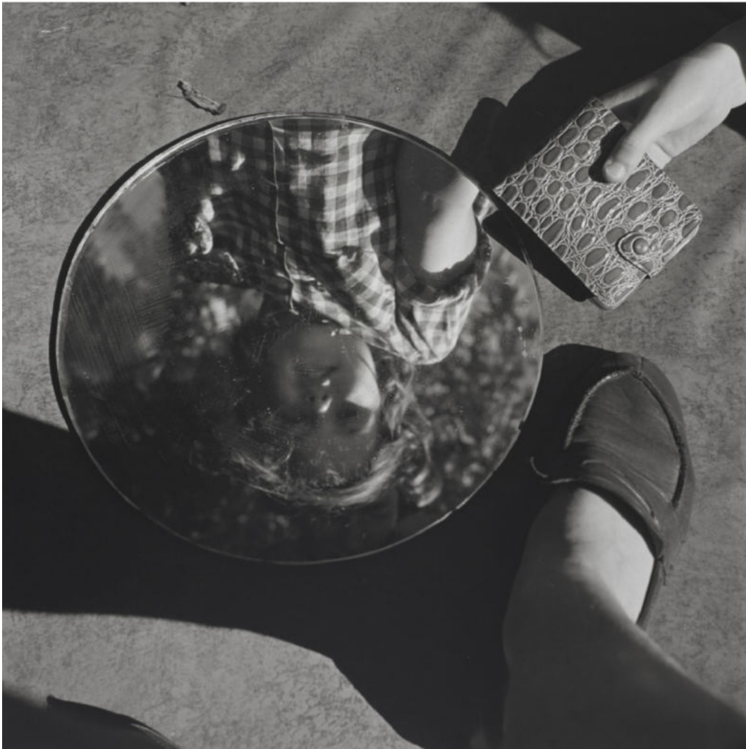
Vivian Maier (USA, 1926 - 21.04.2009)