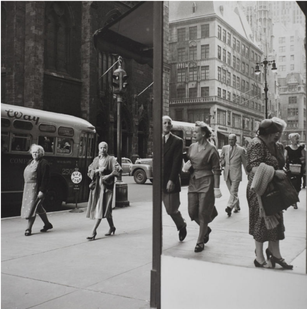
Vivian Maier (USA, 1926 - 21.04.2009)