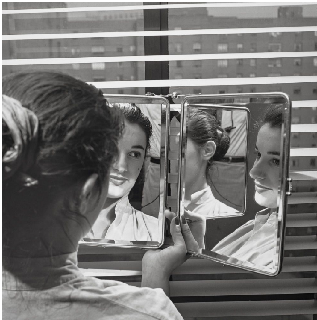
Vivian Maier (USA, 1926 - 21.04.2009)