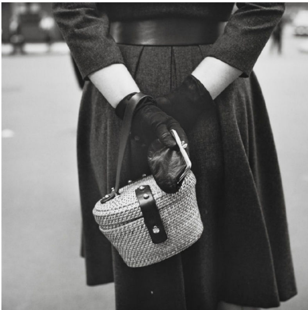
Vivian Maier (USA, 1926 - 21.04.2009)