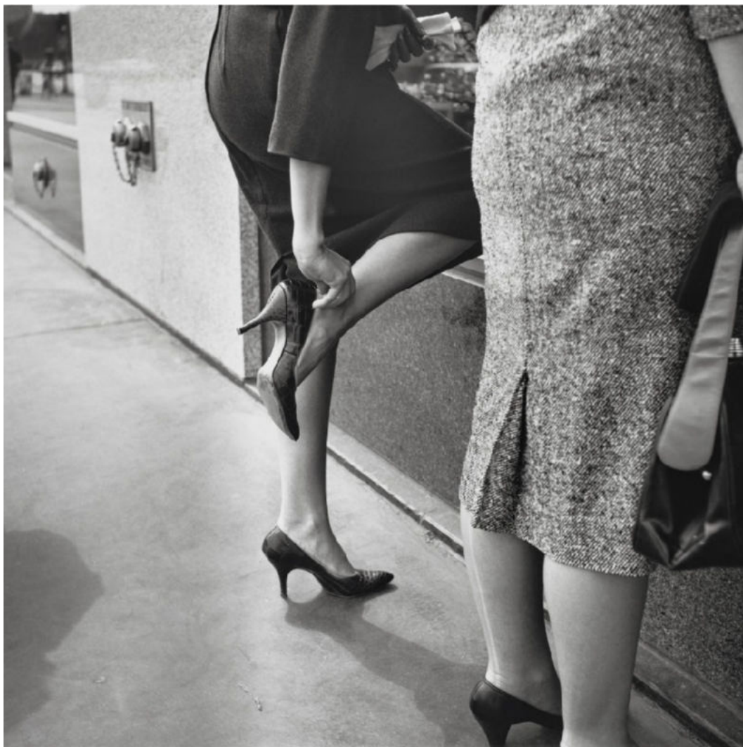
Vivian Maier (USA, 1926 - 21.04.2009)