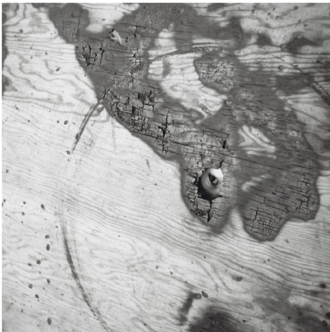
Vivian Maier (USA, 1926 - 21.04.2009)