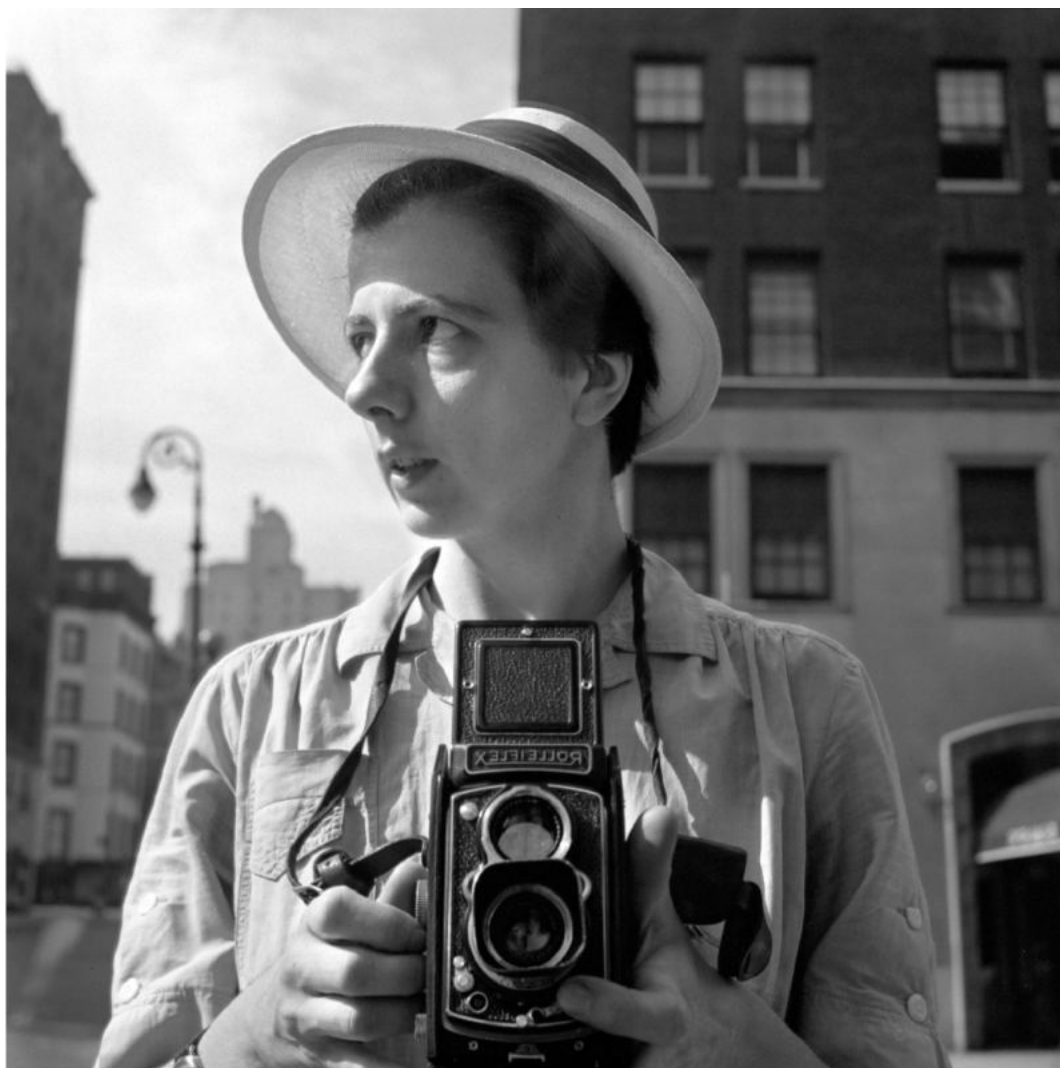
Vivian Maier (USA, 1926 - 21.04.2009)